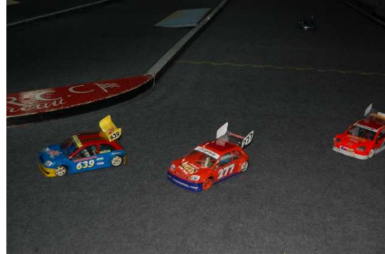
Action from the Hot Rod Grand Final