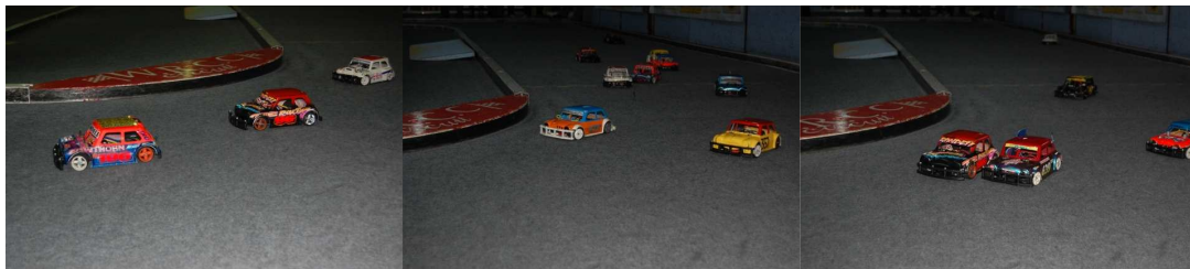
Action for the Ministox Grand Final