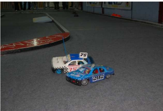
Action from the Saloon Stox Grand Final